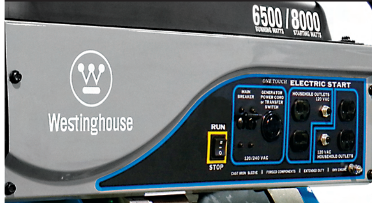
Clean and simple to use control panel.