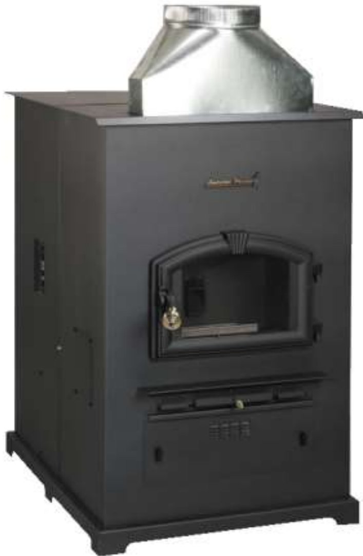
6500 4 Digit Board 3 Heat Ranges