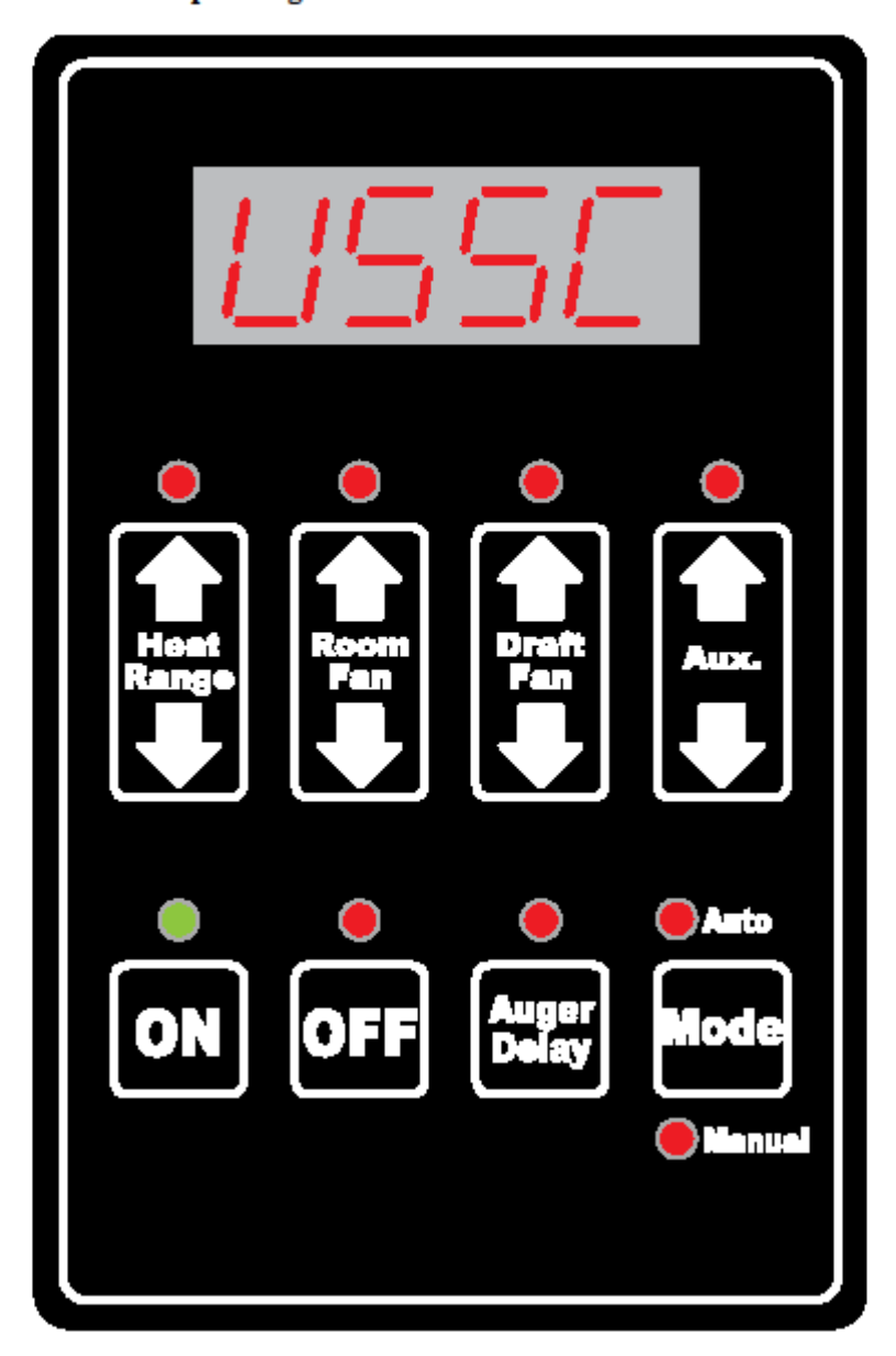
4 Digit 6220 Multifuel Furnace Control Operating Manual Firmware Revision 6.00