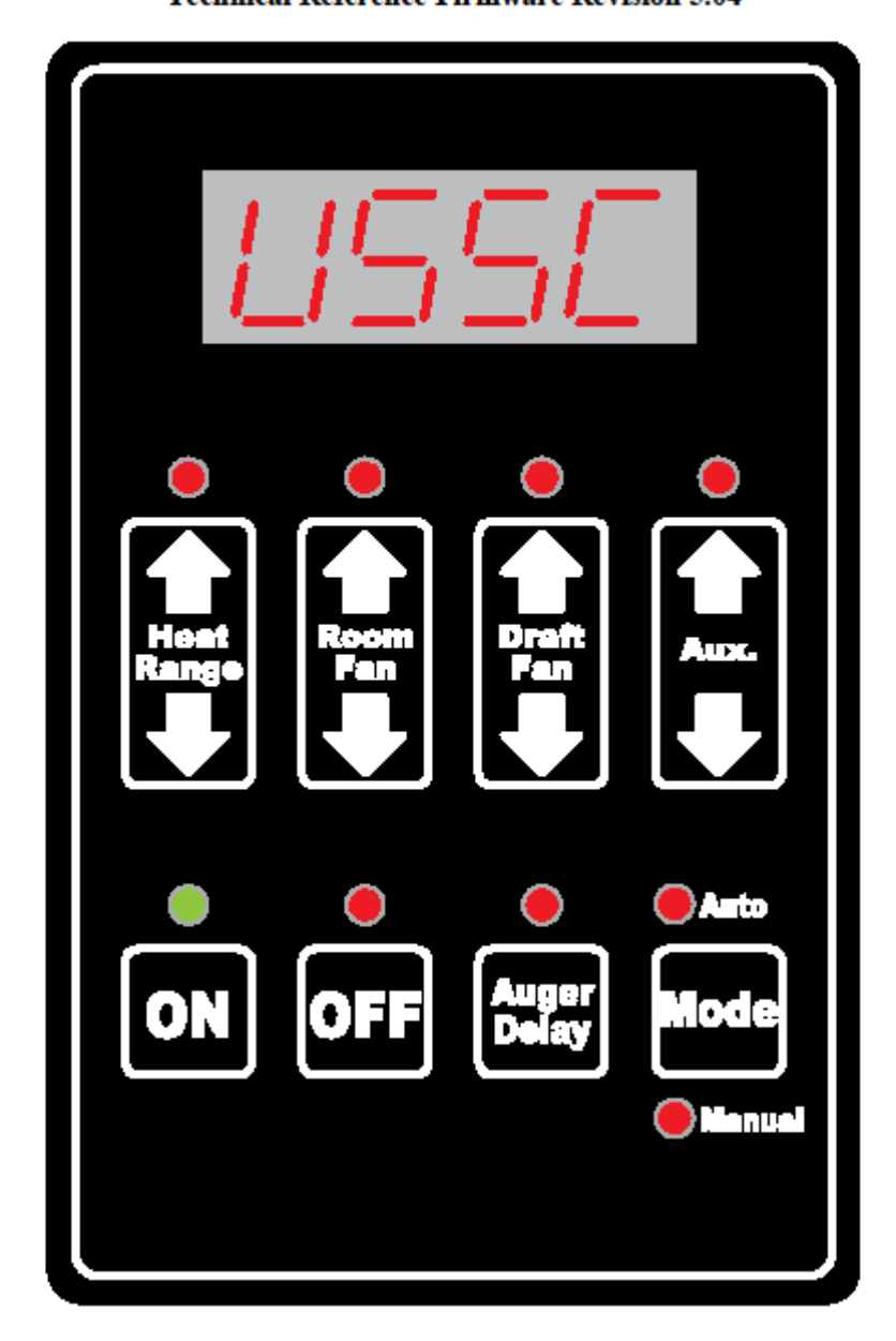
4 Digit 6100 Multifuel Furnace Control Technical Reference Firmware Revision 5.04