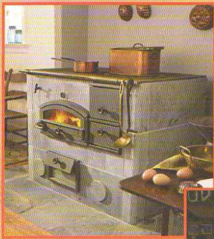
Tulikivi Soapstone Bakeoven/Cookstove LLU1250