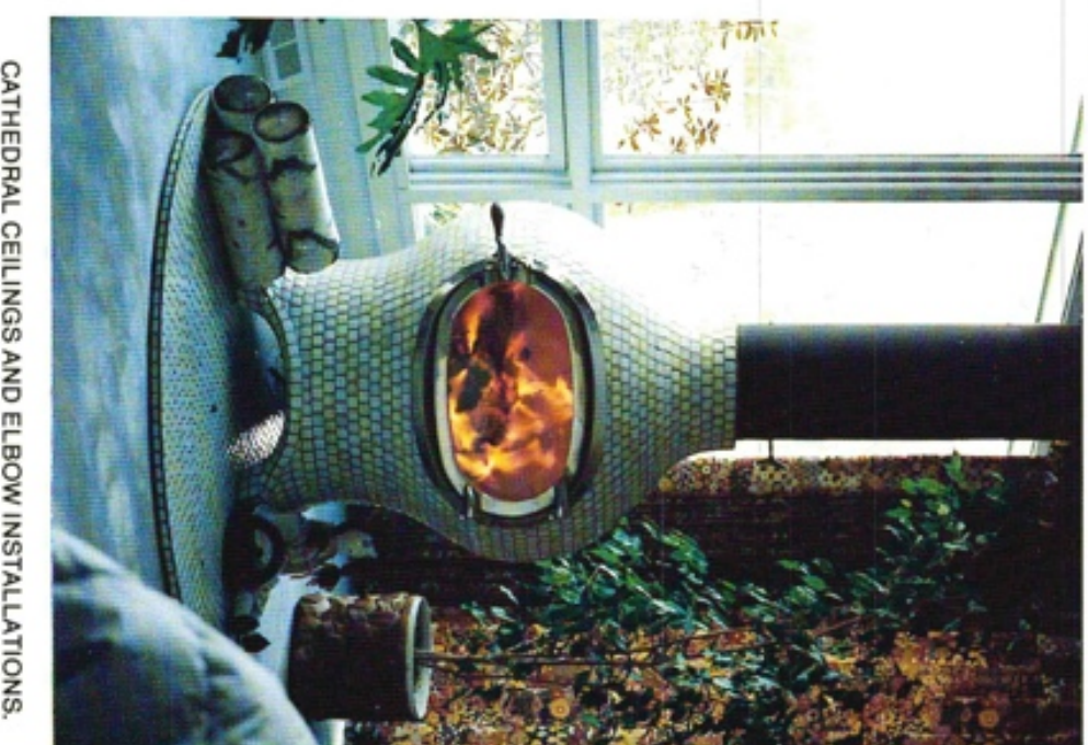
CATHEDRAL CEILINGS AND ELBOW INSTALLATIONS.