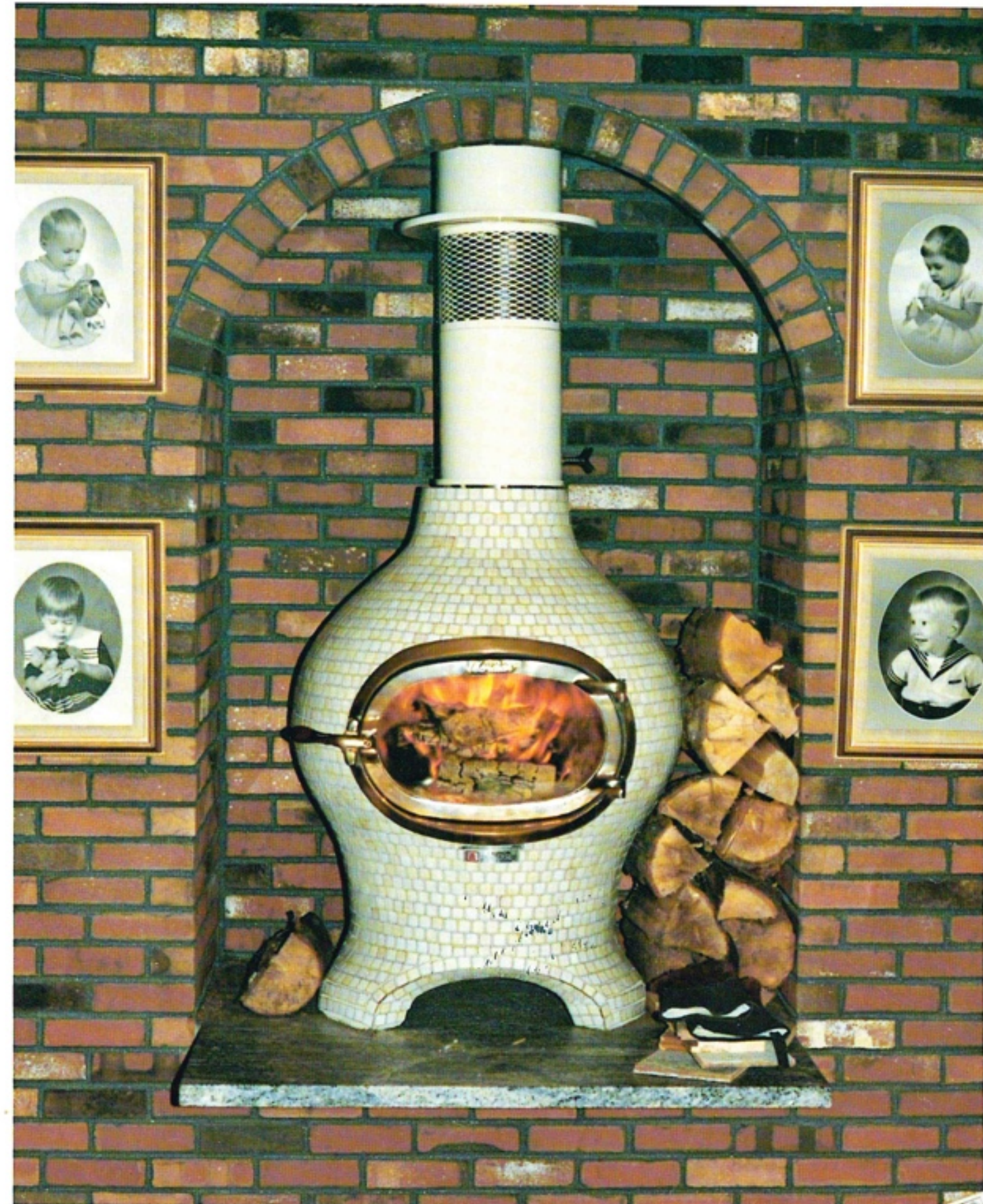
Solid Ceramic Wood/Coal Stove and fireplace insert