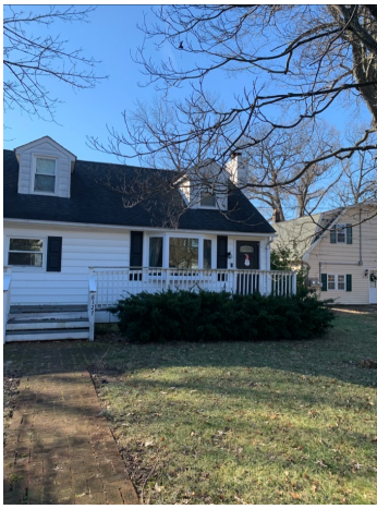
Front of house