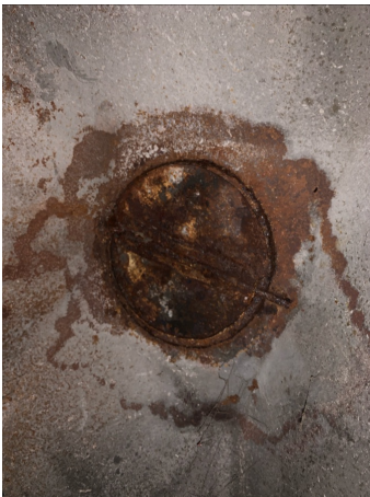
No scan preformed due to conditions of damper, etc