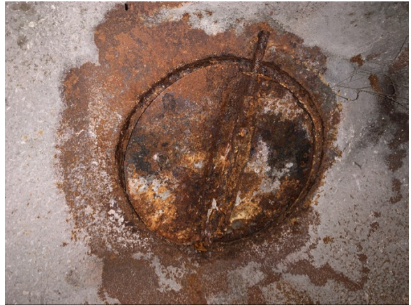
Corroded/ rusted damper / seized