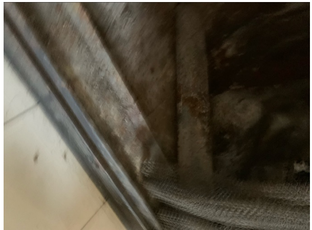
Firebox has multiple warped walls