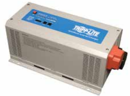
Tripp Lite APS1012SW

1000W PowerVerter APS 12VDC 120V Inverter/Charger with Pure Sine Wave Output,