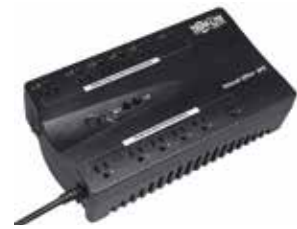
Tripp Lite INTERNET750U