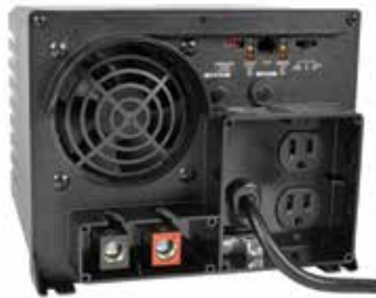
Tripp Lite APS750

750W PowerVerter APS 12VDC 120V Inverter/Charger with Auto-Transfer Switching