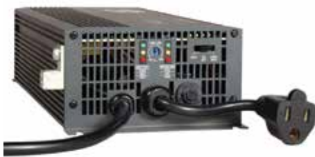
Tripp Lite APS700HF

700W PowerVerter APS 12VDC 120V Inverter/Charger with Auto-Transfer Switching