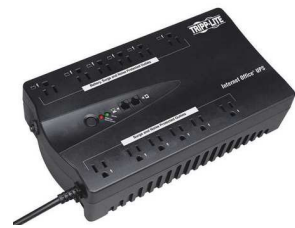
Tripp Lite INTERNET750U