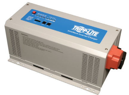
Tripp Lite APS1012SW

1000W PowerVerter APS 12VDC 120V Inverter/Charger with Pure Sine Wave Output,