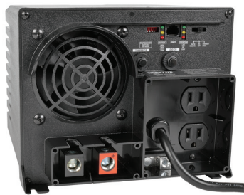
Tripp Lite APS750

750W PowerVerter APS 12VDC 120V Inverter/Charger with Auto-Transfer Switching