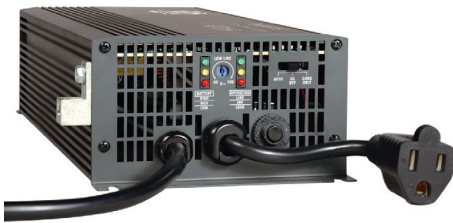
Tripp Lite APS700HF

700W PowerVerter APS 12VDC 120V Inverter/Charger with Auto-Transfer Switching