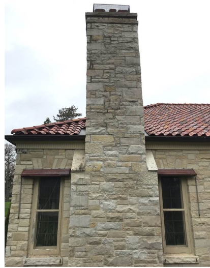
Notes: Side of house and chase