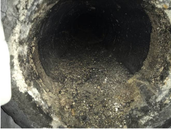
Label Abandoned flue entrance point