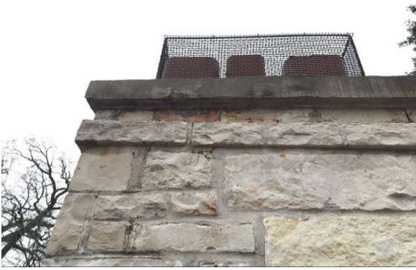
Label No rain guard on multi flue animal guard