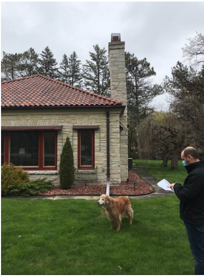
Notes: Front of house