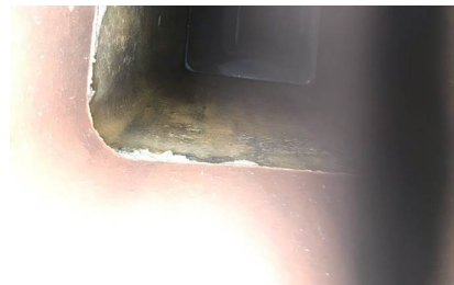
Notes: Abandoned flue (towards back yard)