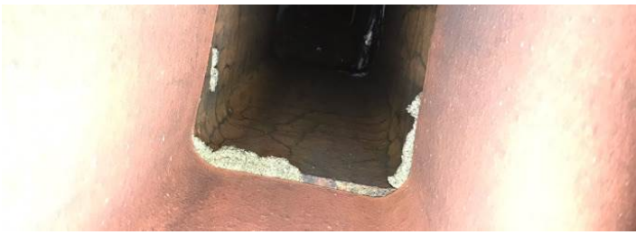
Notes: Center flue