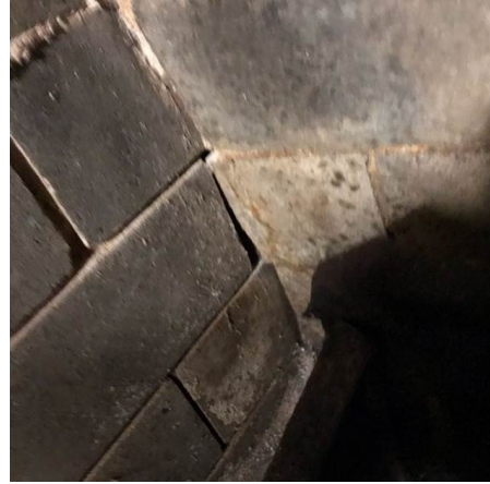
Label Eroded joints in firebox