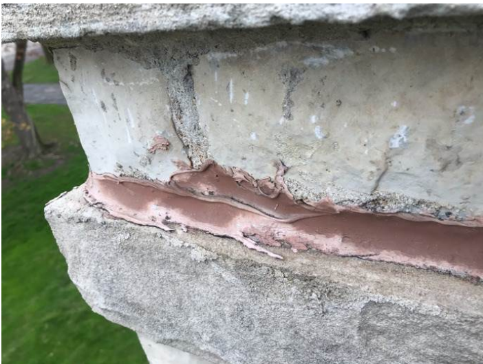
Notes: Remove old calk and remortar (pitch out)