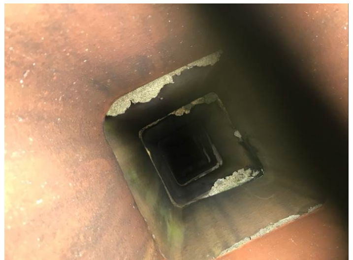
Notes: Front flue