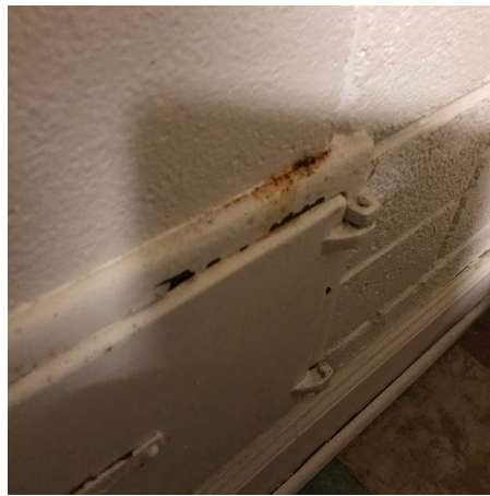
Label Clean-out door (rust showing)