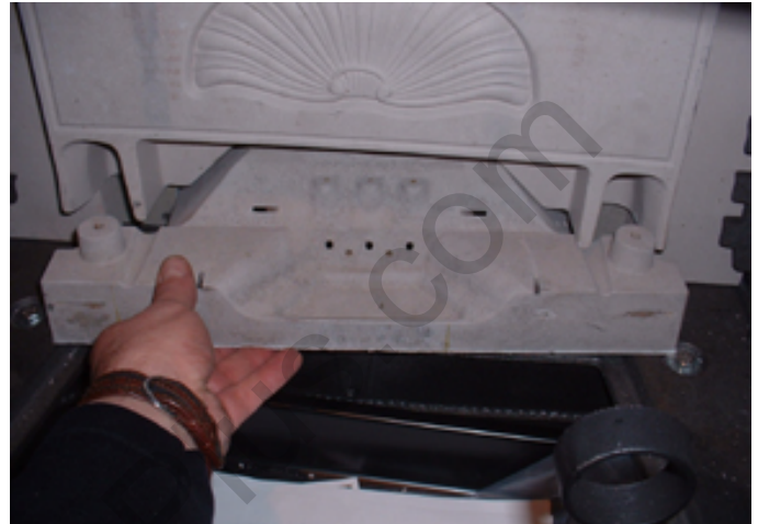
Fig. 1 Remove shoe.