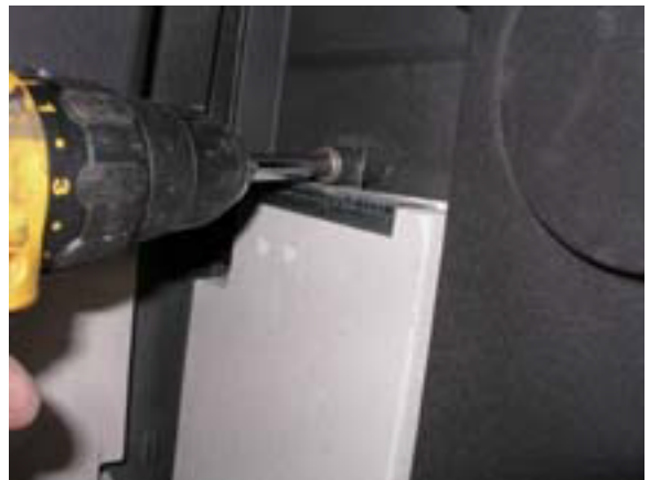
Fig. 2 Remove side brick.