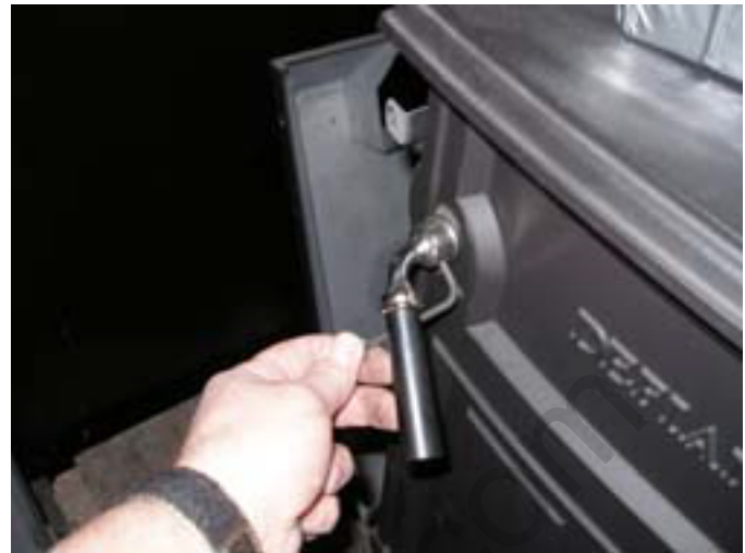
Fig. 5 Remove damper handle. KT1513