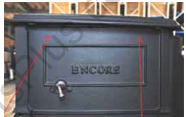
Fig. 9 Stove top that is not level.