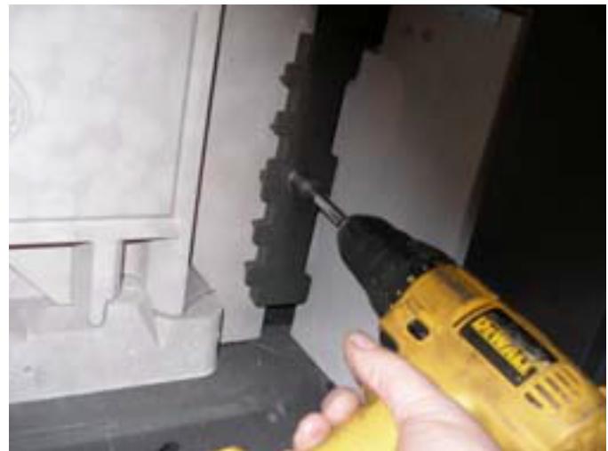
Fig. 7 Remove fireback brackets. KT1515