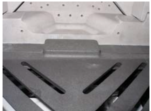
Fig. 10 Install the grate with the tab holding the shoe in place.