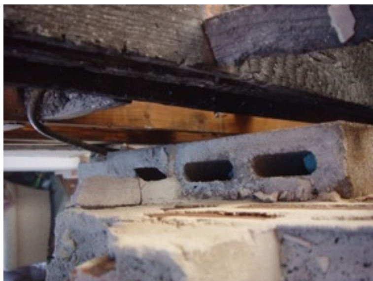
(Above- Hollow blocks used in rear wall construction)

The firebox wall is not up to this standard.