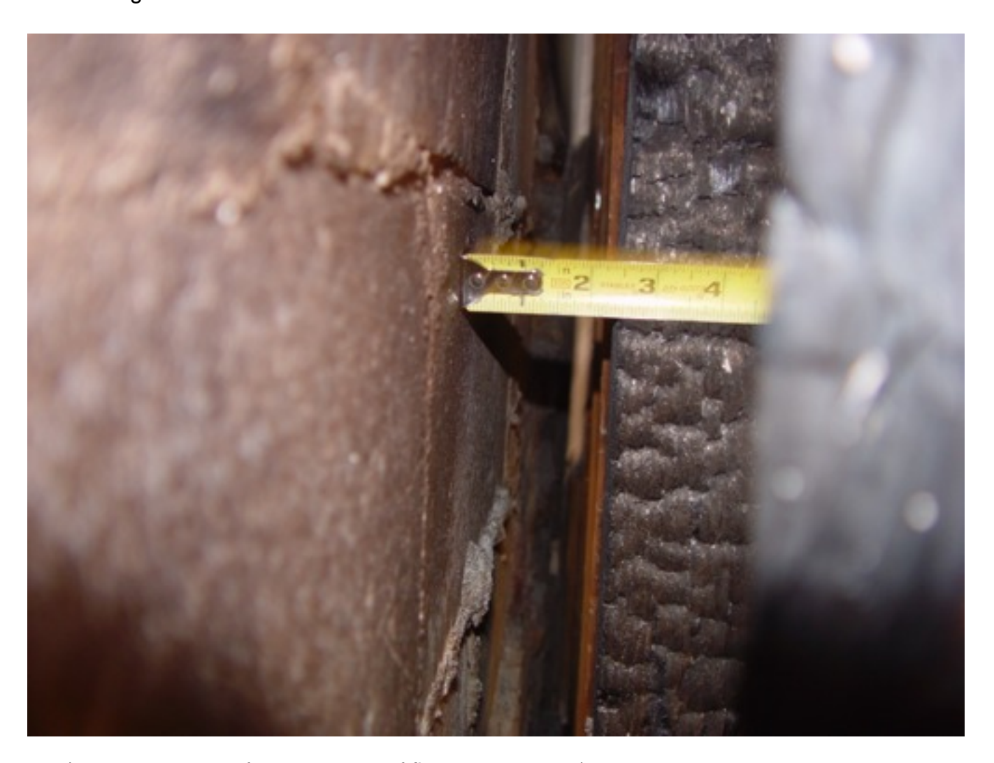
(Above - distance from rear wall of fireplace to studs)

faces of masonry fireplaces. The air space shall not be filled, except to provide fire blocking in accordance with Section R1003.13.